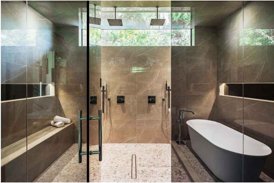
In the master bathroom, Hoyos created a large wet room with a double shower and freestanding tub that can be closed off from the rest of the space.